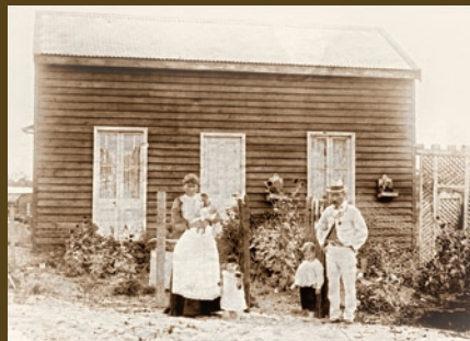
TOV Local History Collection PH01412 courtesy Marj Cook